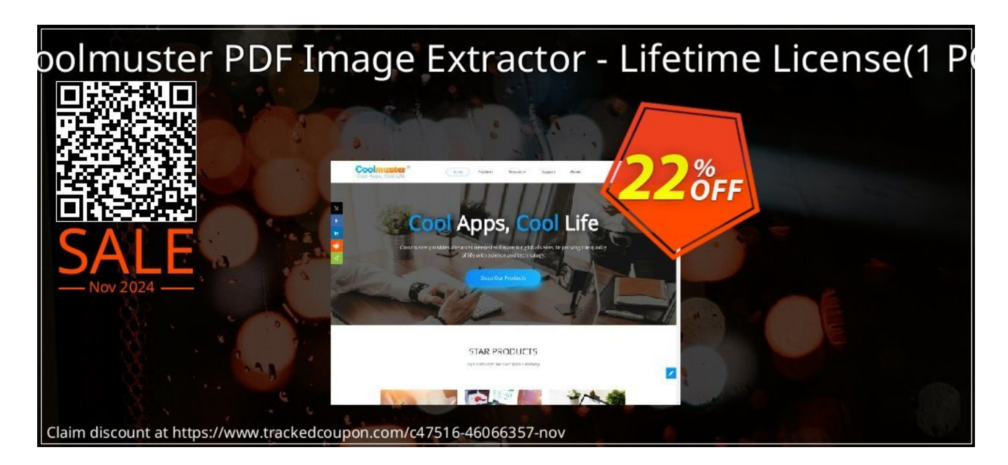
To claim this Coolmuster PDF Image Extractor - Lifetime License(1 PC) discount now