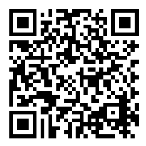
To view the price chart of SysTools PDF Form Filler by the time