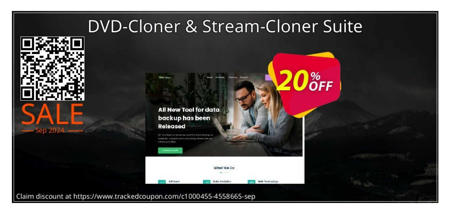
To claim this DVD-Cloner & Stream-Cloner Suite discount now

You can get the coupon by scan QR codes below: